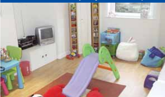
The finished basement after waterproofing. Now warm and dry.

To discuss the most appropriate solution for your basement, call our technical department on: 01403 210204 or visit our website at: www.safegardeurope.com